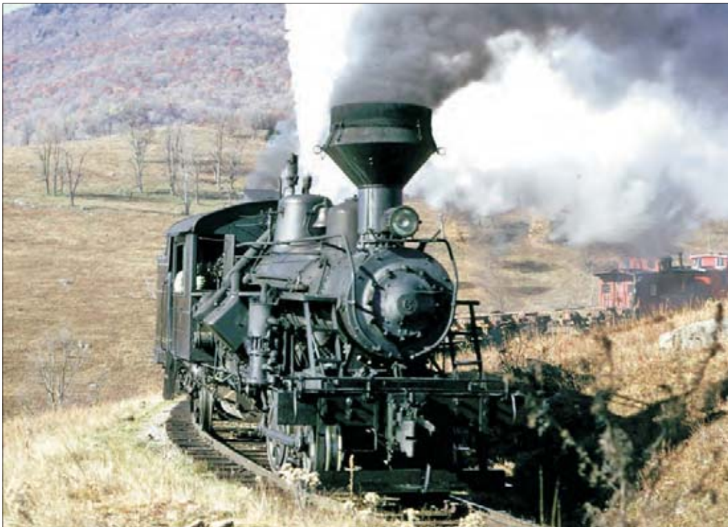
Heisler 6 was also used on the 1973 charter shown on the previous page. The Radley & Hunter stack worn on the Meadow River was changed for a standard Cass diamond in 1970.