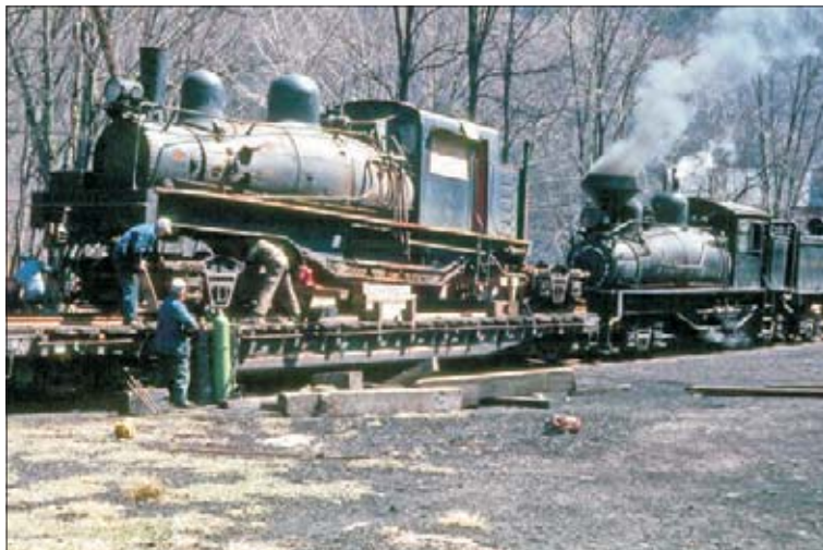
Shay 2 being unloaded at the Cass shop in 1971 after arrival from Vancouver, B.C., Canada. Shay 4 is the shop goat.

Railfan Weekend 1972 was hugely anticipated because