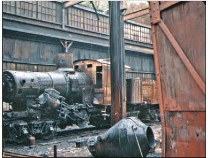
Upper left and right: Shay 3 and Climax 9 after the shop fire.