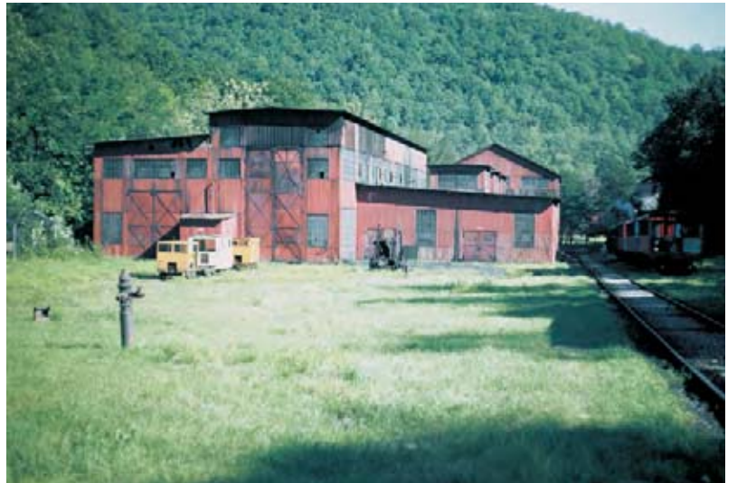
The old shop from the west: tall doors mark the locomotive bays. The highest pair were made to clear a skidder superstructure. The single story portion is the machine shop.