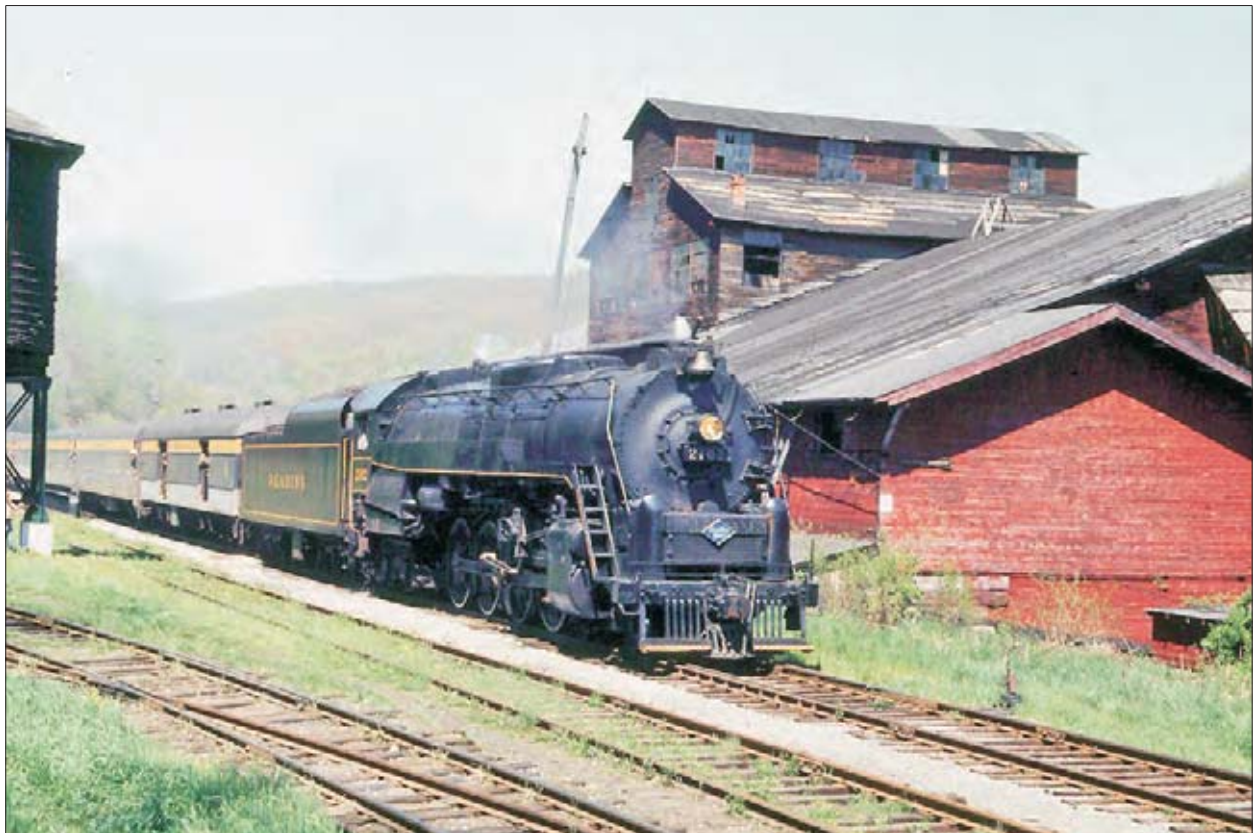
A southbound Greenbrier Scenic Railroad excursion passes the Cass sawmill and water tank in 1971. On one such trip, a tender wheel derailed as the crew attempted to back in and take water. In years past, there had been a water column at this location, serving the C&O main track; its concrete base pad is visible next to the tender.