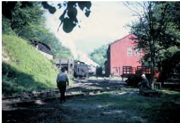
The 1922-1972 shop from the east in 1968: The peaked roof is the storeroom. The coal dock is on the left; the main line to Bald Knob runs adjacent to the building.