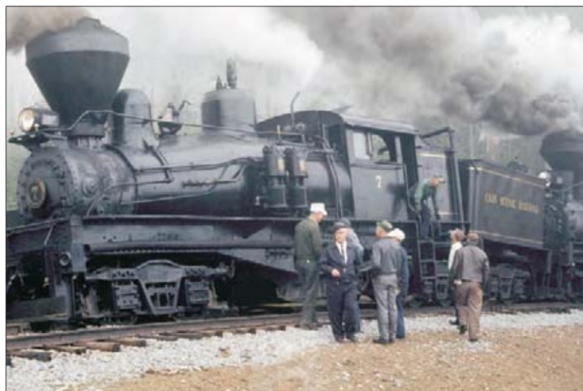
Shay 7 derailed at Bald Knob during Railfan Weekend 1969.

the dense fog. The audience was a little uncertain, but the veteran train crew, a number of whom had worked on log trains, had seen this many times before; the problem was taken care of in less than an hour.