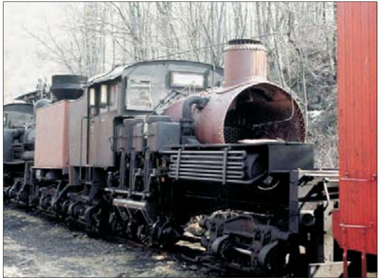
Shay No. 7 on the Cass dead line in 1971.

In 1971, fans enjoyed some completely different railroad action at Cass as the Greenbrier Scenic Railroad began operating on the 90 miles of C&O trackage between Roncevert and Durbin. The power was the very large ex-Reading 4-8-4 No. 2102, pulling a long string of mostly C&O classic passenger cars. The train stopped in Cass, allowing passengers an opportunity to experience the former logging railroad.