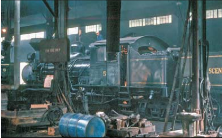
Shay 5 under overhaul in the old Cass Shop.

Countering the addition of the Climax was a significant roster loss. After the 1970 season, Shay 7 was found to require replacement of the first boiler course. A new section of boiler shell was procured which proved to be unacceptable. Then another attempt at fabrication by a different vendor was also rejected. The Shay has sat on the dead line ever since.