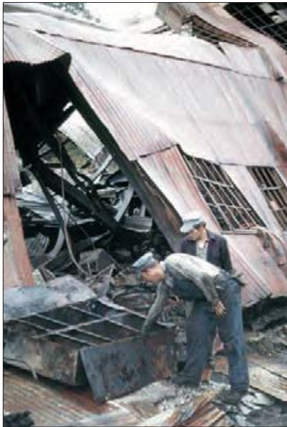
Center right: Shay 3 under restoration in April of 1973. The shop crew worked outside all winter.