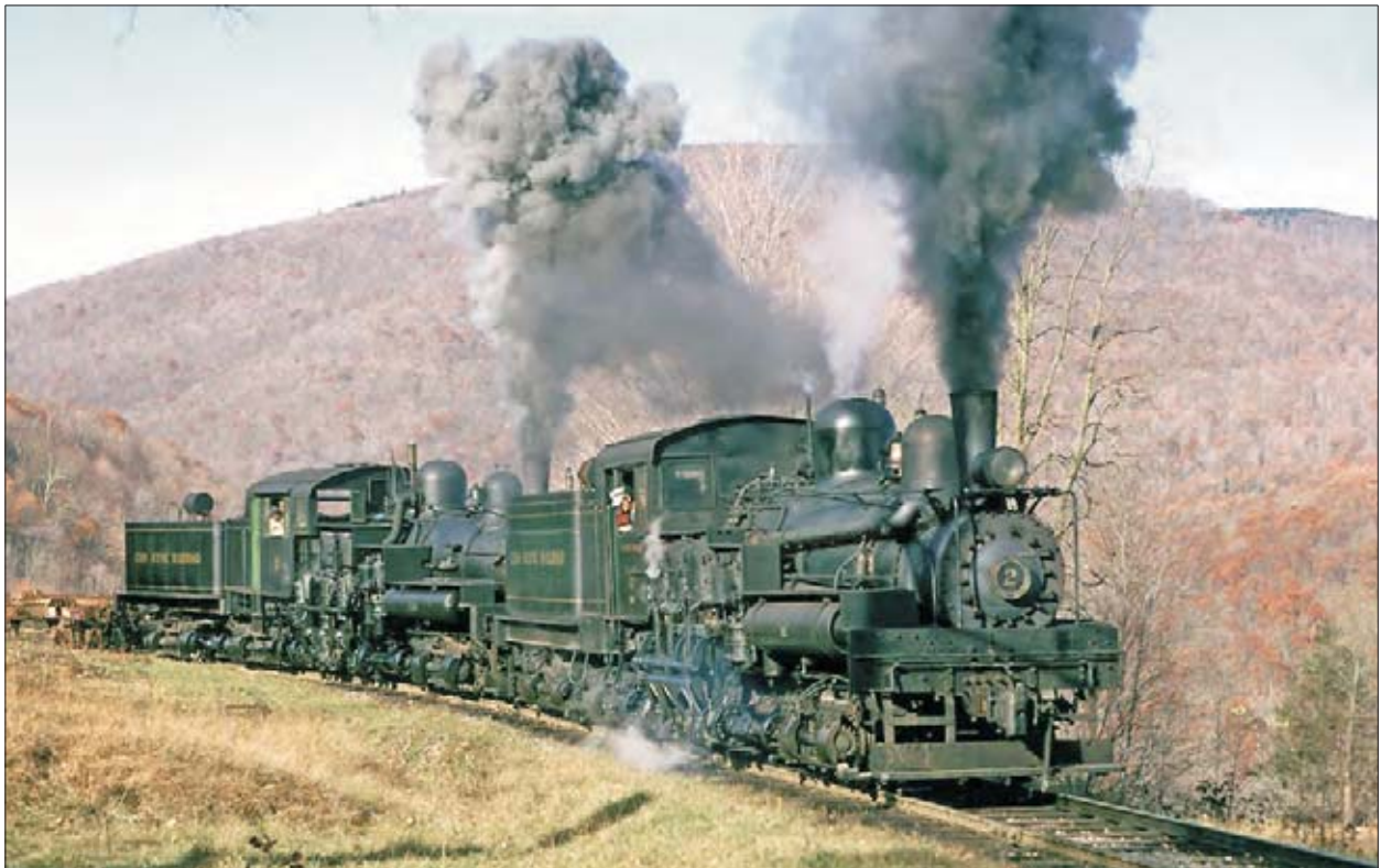
A November, 1973 charter run found Shays 2 and 3 performing on the S-Curve below Whittaker, hauling ex-Meadow River steel skeleton log cars. Shay 2 was still a “stock” PC-13, having a straight stack and a bald smokebox front, its appearance quite different from today.